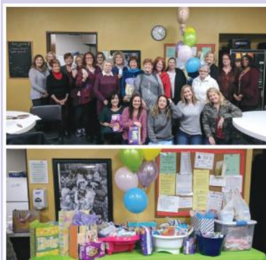
Lifepoint Church Hickory