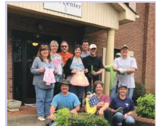
Mountain View Baptist Work Team