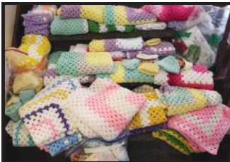
Messiah Lutheran WELCA

Fear not, for I am with you; be not dismayed, for I am your God. I will strengthen you. Yes, I will help you, I will uphold you with My righteous right hand. Isaiah 41:10 NKJV