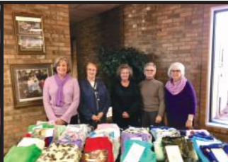
Christ Lutheran Church LWML