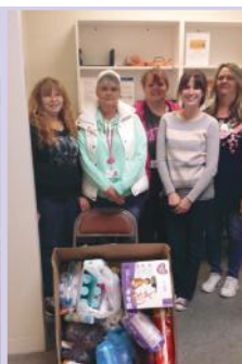
Geiger Furniture Diaper Drive