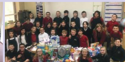
3rd Grade Hickory Christian Academy