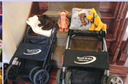
Concordia Lutheran Church