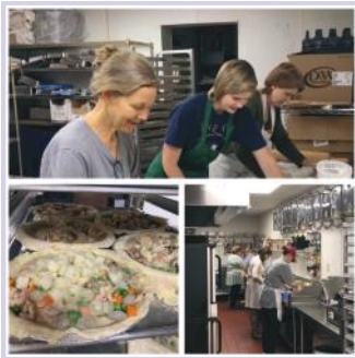
Harvest Bible Chapel Women's Chicken Pie Fundraiser