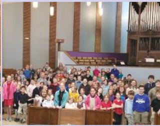
St Stephens Lutheran School

Thanks to these groups and the many more who gave gifts to the PCC. We appreciate you!