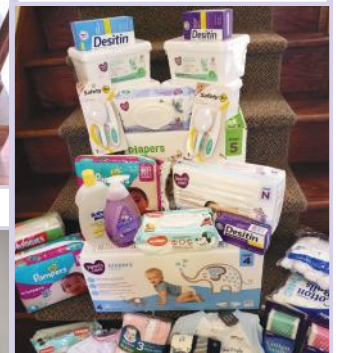
Faith Sunday School Class - Tri-City Baptist