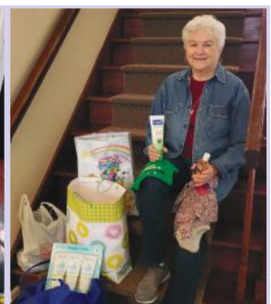
Penelope Baptist Church