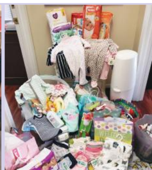
Winkler's Grove Baptist Church