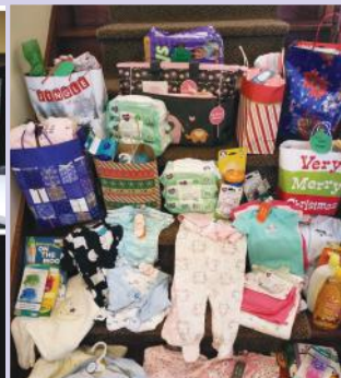
Children's Ministry of Tri-City Baptist