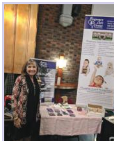
LRU Internship Fair