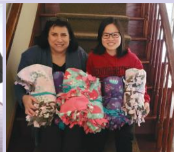
Mountain Grove Baptist Church