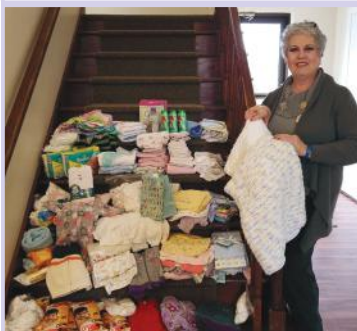
Mt. Zion Lutheran Church