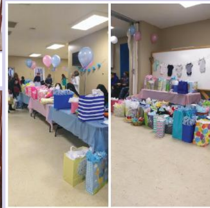
Christian Family Academy