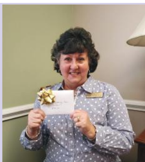
Blackburn Baptist Church Donation