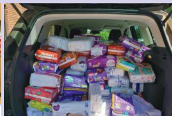
His Kids Consignment