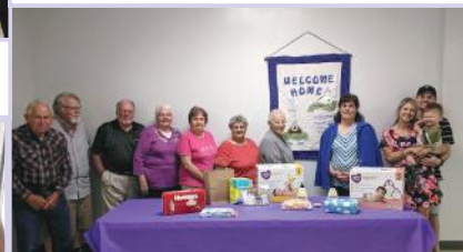
KWML of Augusta Lutheran Church