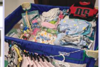
Messiah Lutheran Church