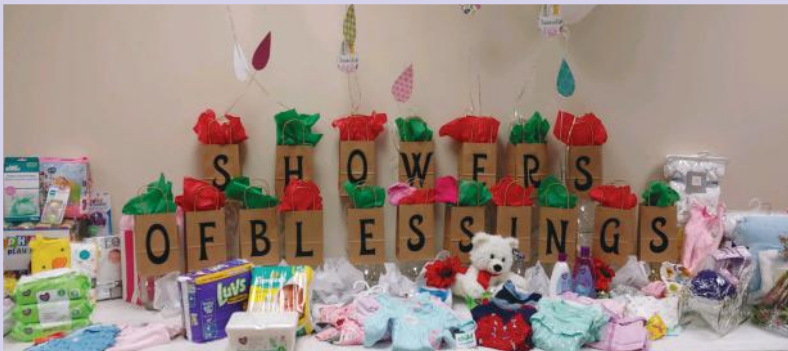
Oxford Baptist Women's Baby Shower