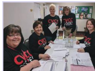
CVCC DOES Employee Team Feedback Survey Below