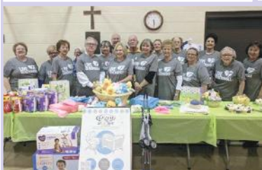
Bethany Lutheran Hickory