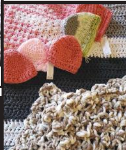
Twin Knit Creations

Thank You To All for the Handmade Gifts for Christ's Little Lambs!