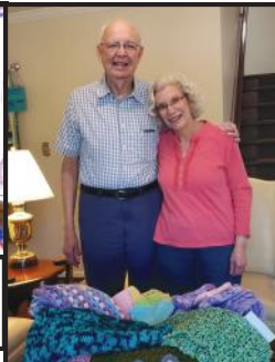
Miller's Lutheran Church -Miller's Yarners