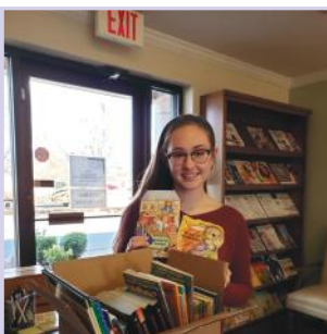
University Christian High School—National Honor Society

- “I used PCC services with my first pregnancy. I was 22, not married, and terrified. They confirmed my pregnancy, and from there, I started coming to the classes to earn my mommy bucks. They helped us so much! My boyfriend at the time, the father of my child, and I were struggling a lot. Flash forward 12 years, my son will be 12 in July. I am married to that boyfriend. We have a 4 year old daughter, and another baby on the way. All because someone reminded me that not only Jesus loves me and my baby, but that complete strangers care about me and my baby. Now we pay it forward. We have been donating to you guys, as often as we can, for the last 10 years. Thank you!”