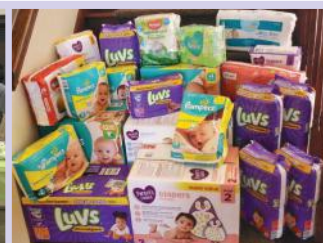
Cornerstone Church of Maiden—SOHL Sunday