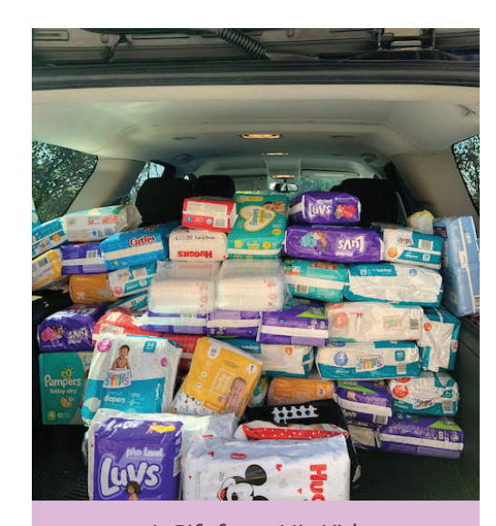
A Gift from His Kids Consignment