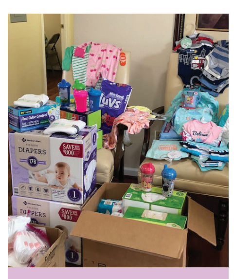
A Gift from Shiloh UMC, Claremont