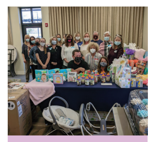
Discovery Church Baby Shower