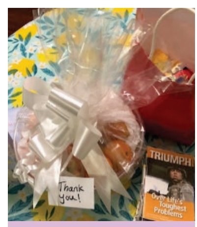
A Gift from Providence Baptist Church