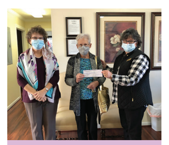
A Gift from The Lutheran Women's Missionary League Carolina's District