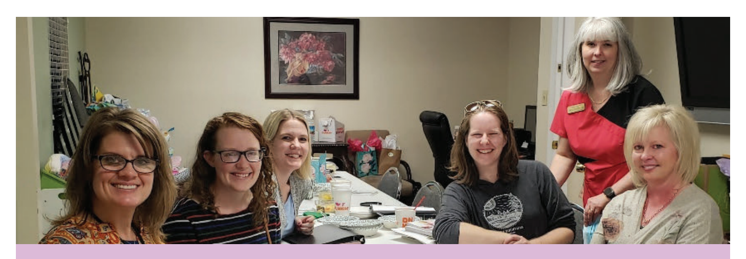
Tabernacle Baptist Church Homebuilder Group