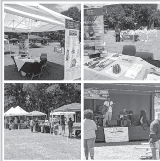
Ridgeview Summer Jam