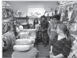
St. Aloysius Catholic Church Youth