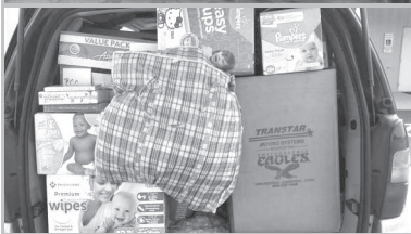
His Kids Consignment