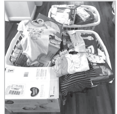
Shiloh Methodist Church