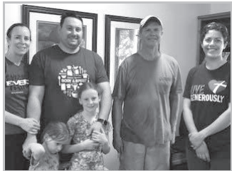
Corinth Reformed Work Team