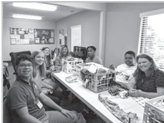
Holy Name of Jesus Cathedral Raleigh, NC