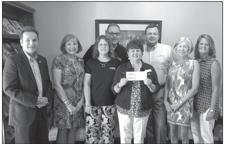
Donation from 106.9 The Light's HEARTBEAT FOR HOPE Fundraiser on May 9, 2019