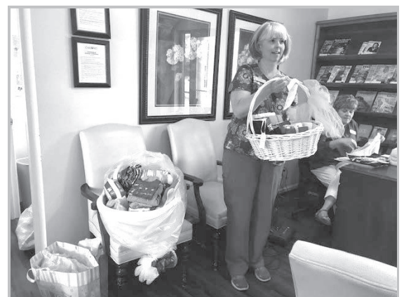
Blackburn Baptist Church