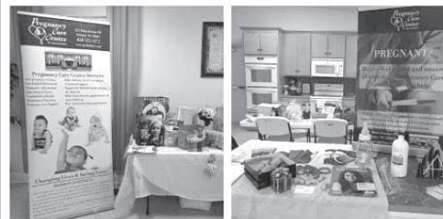
Faith Olive Baptist Church