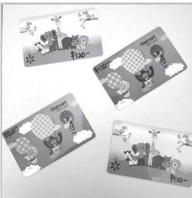
Walmart Crib Gift Cards