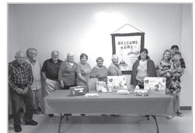
Augustana Lutheran Church