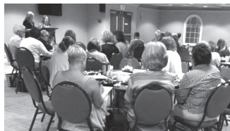
Area Adoption In-Service at Hickory Bible Church

South Mountain Baptist Camp Youth Team (Picture not available)