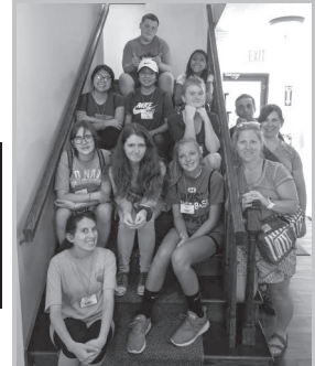
Vertical Life Youth

South Mountain Baptist Camp Youth Team (Picture not available)