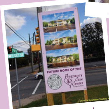
Our future home!