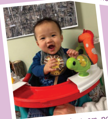
We love our volunteers, no matter how small!!