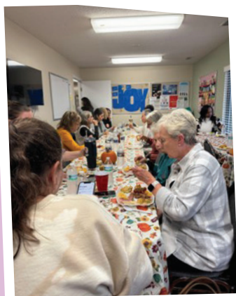
Our annual Volunteer Appreciation Lunch!