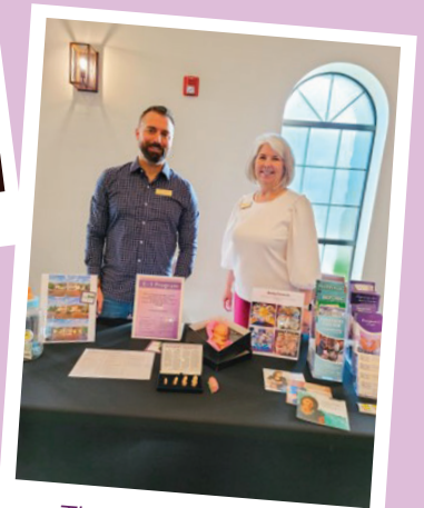
Thank you to Grace Covenant Church for welcoming us!

Thank you to this amazing community. You give without measure, and we are truly thankful for your support.