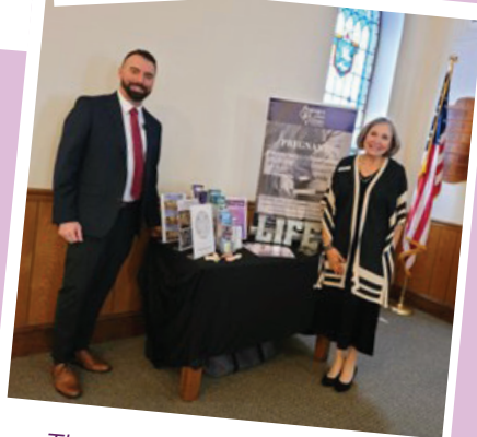
Thank you to May's Chapel Methodist Church for allowing us to share our mission with you!