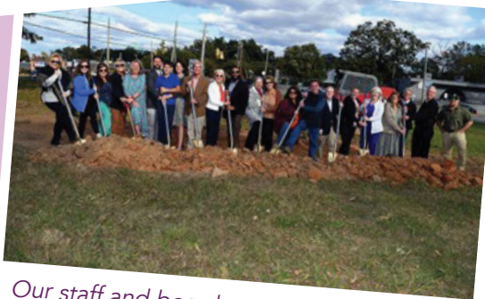
Our staff and board at our Groundbreaking Ceremony for our new PCC home!