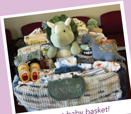
Recent baby basket!

Thank you to this amazing community. You give without measure, and we are truly thankful for your support.