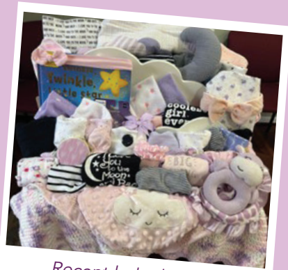
Recent baby basket!