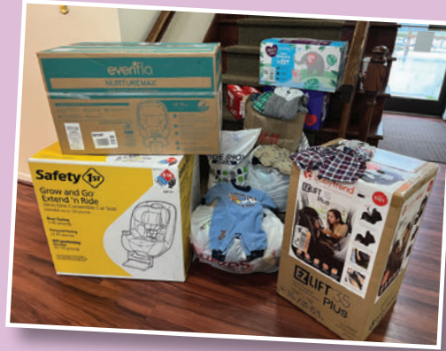
Thank you Mountain View Baptist!