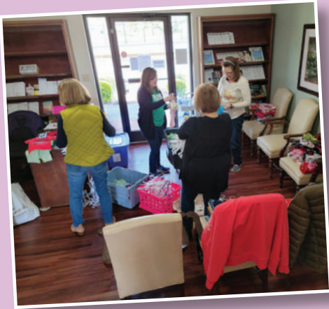
Thank you volunteers from Mountain View Baptist Church