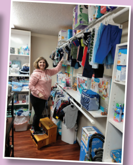
Volunteer helping sort baby clothes