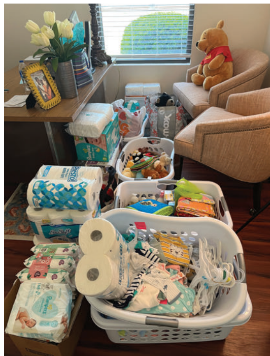
Donation from Hickory Bible Church