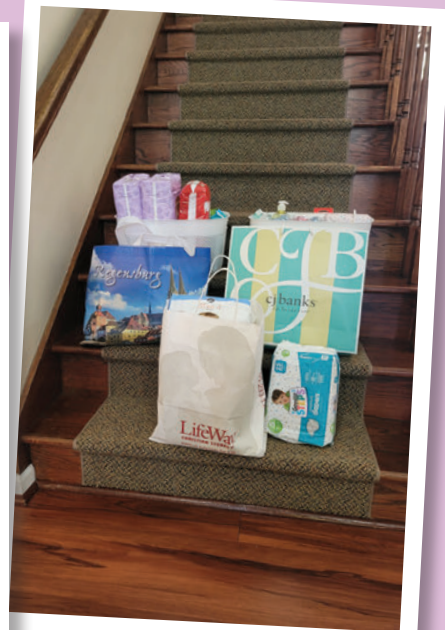
Donation from Catawba United Methodist Church

Thank you to this amazing community. You give without measure, and we are truly thankful for each of you.