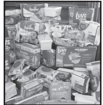
New Life Authentic Christian Community