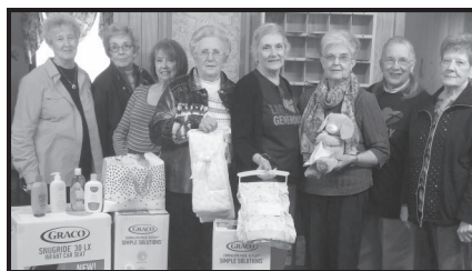
Ladies of Immanuel Lutheran Church