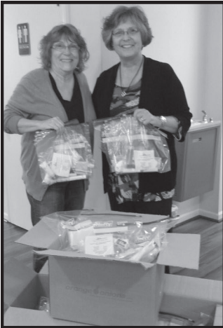
Christ Lutheran Church