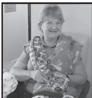
Love Knots of A C Moore