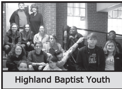
Highland Baptist Youth