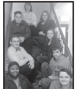
Rock 127 Bethlehem Baptist