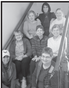
Dorcas Ladies Christ Alive