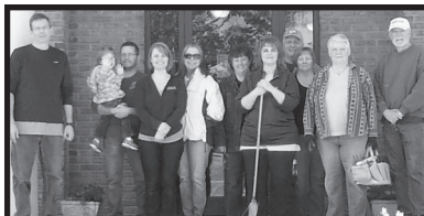
Mountain View 9am Median Adults