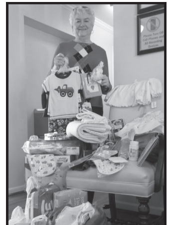
Penelope Baptist Church