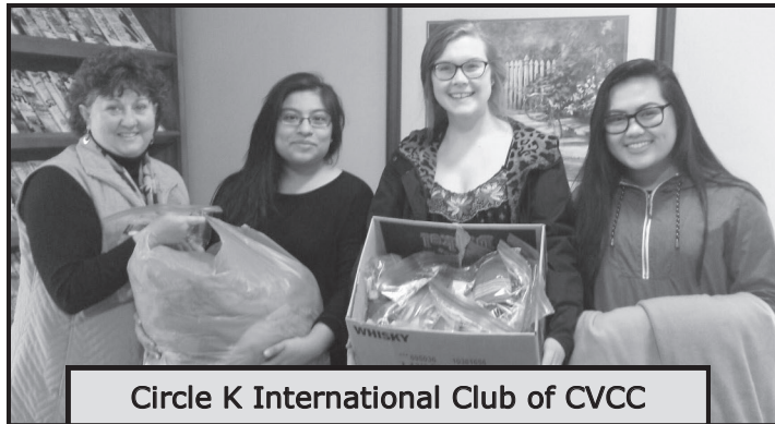
Circle K International Club of CVCC