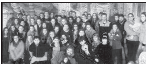
AMPLIFY-Mountain View Youth