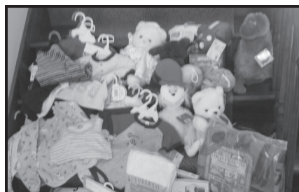
St. Paul's Reformed Newton