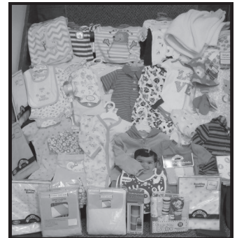
Sweetwater Baptist Church