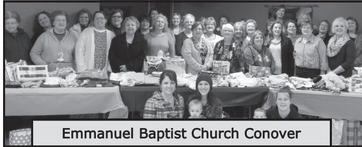
Emmanuel Baptist Church Conover